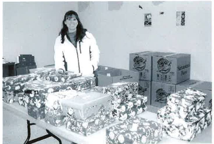
A Stephenson area 4-H leader brings colorful boxes prepared by the group.